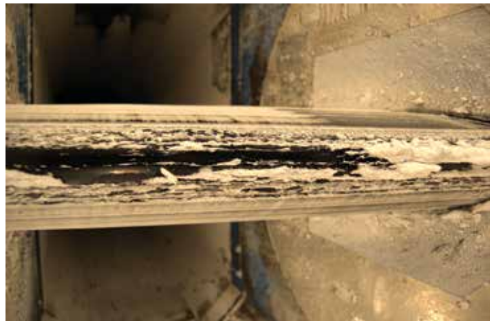
Flight proven and fully tested in our icing wind tunnel.