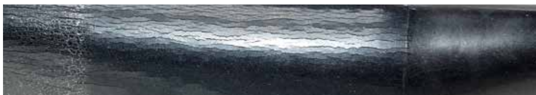
Figure 2. Neoprene pneumatic de-icing boot surface material that has been exposed to ozone. The right side was treated with a recommended treatment material.

Low cost – Pneumatic boot systems are a proven and effective de-icing solution and are economical to purchase and operate. Pneumatic systems also have one of the lowest operating costs — even when the cost of maintenance and eventual boot replacement is considered.