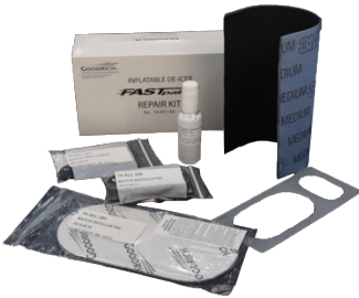
P/N 74-451-AA For black de-icer