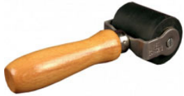
P/N 74-451-74 2" x 2-1/2" Rubber roller