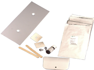
P/N 74-451-AE For black de-icer