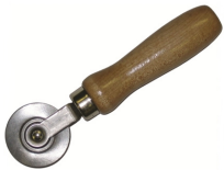
P/N 74-451-89 1/4" Steel stitch roller