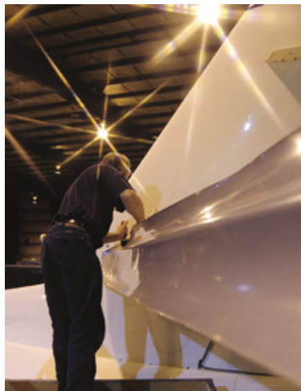
Also available in FASTboot® for easy installation.